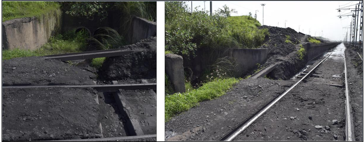
Fig. 3: A view of arrangements in railway siding to channel the runoff into South Quarry Sump via a culvert.

Surface runoff from R7, which is external overburden slope, well vegetated, should be channelized into the Sump 4.