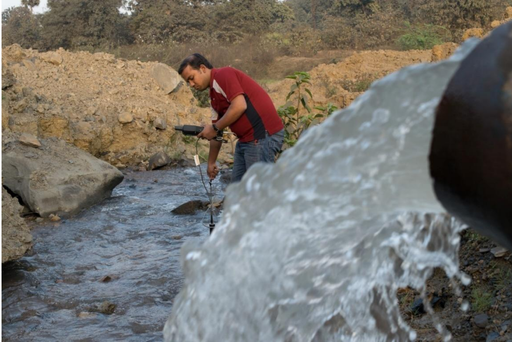
Fig. 2: Measurement of water quality parameters for mine discharge

Water quality analysis was carried out to ascertain the quality of water in the mine sumps as well as the mine discharges. Samples were collected during March 2015 to know the pre-monsoon status; and again in August 2015, to know the status in monsoon. Water samples were analyzed following the APHA (2012) and CPCB guidelines. Some of the parameters viz. pH, Conductivity, Total suspended solids (TSS), Conductivity etc. was measured at the site by using a multi-parameter water quality analyzer (Figure 2). The results of the analysis are presented in Table 3.