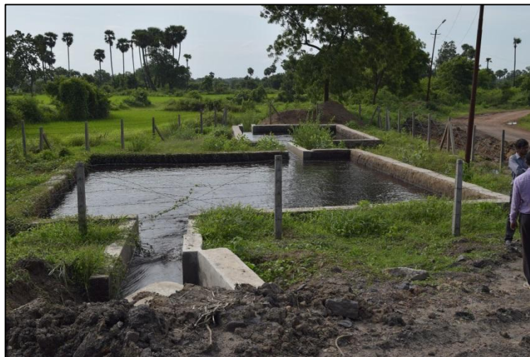
Fig. 4: Overflow of the sedimentation pond is released to the nearby paddy fields

It is recommended to construct a sedimentation pond for the railway siding with a dimension of 1529m 2 having a depth of 3m.