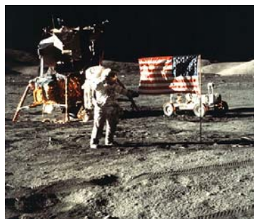
Fig 1: Astronaut landing on the moon.

Although the president's announcement did not mention it explicitly, his message implied an important role for the private sector in leading human expansion into deep space. In the past, this type of public-private cooperation produced enormous dividends. Recognizing the distinctly American entrepreneurial spirit that drives pioneers, the President's Commission on Implementation of U.S. Space Exploration Policy subsequently recommended that NASA encourage private space-related initiatives. If government efforts lag, private enterprise should take the lead in settling space. We need look only to our past to see how well this could work. In 1862, the federal government supported the building of the transcontinental railroad with land grants. By the end of the 19th century, the private sector came to dominate the infrastructure, introducing improvements in rail transport that laid the foundation for industrial development in the 20th century. In a similar fashion, a cooperative effort in learning how to mine the moon for helium-3 will create the technological infrastructure for our inevitable journeys to Mars and beyond. Fig 1 shows astronaut landing on the moon.