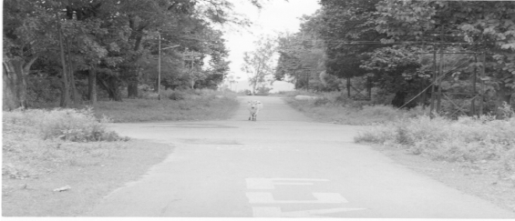
Fig. 4 (a) Image of road from a different angle

upper threshold has been taken to be 110 and 45 as lower threshold.