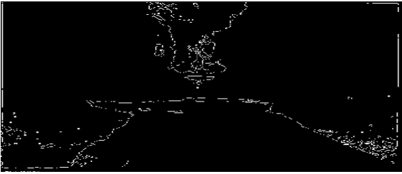
Fig. 4 (b) Boundary extracted image of 4-(a), implemented in Matlab