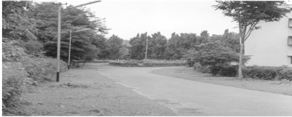
Fig. 2(a) The original image of road

Also, 0 \leq I_{\min} < a < b \leq I_{\max}