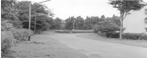
Fig. 2 (b) The median filtered image of (a)