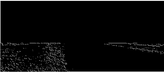
Fig. 5 Boundary extracted image of the image in Fig. 4-(a), implemented in C++