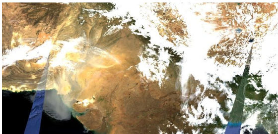
Fig. 1. Study Region for the dust storm investigation using MODIS surface reflectance dataset (for time period dates composite of 2018-05-01 and 2018-05-02)